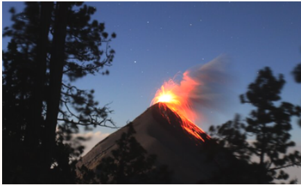
Overnight Volcano Hike

Guatemala is an amazing country with a rich heritage. Antigua is protected as UNESCO World Heritage Site for its old structure and beautiful culture. Guatemala is known for coffee production and chocolate! Our main event will be the Volcano hike, with additional tours and opportunities around this.