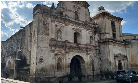
Enjoy Antigua's Architecture